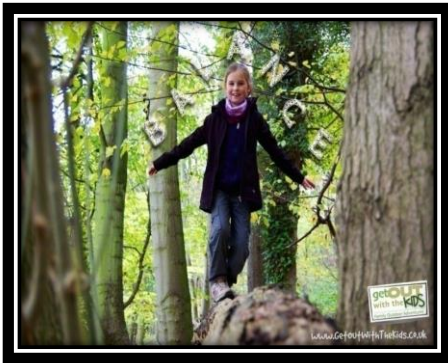
Balancing on a tree branch.