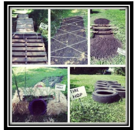
Playing games by creating obstacles from natural materials.