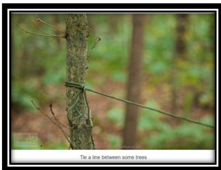
Tie a line between two trees.